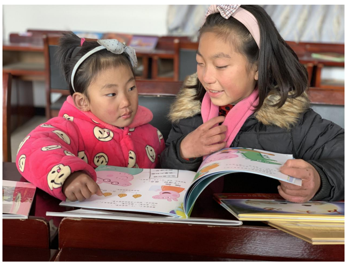
Two sisters are reading picture books during the public welfare picture book reading activities in Red Willow Village in Xiaoxian, photoed by Zixuan Wu.

Early childhood reading in a less developed area of China "Popularization of Picture Book Reading in Xiaoxian" Introduction of the situation in Xiaoxian and possible solutions to some problems according to model city, Guangzhou